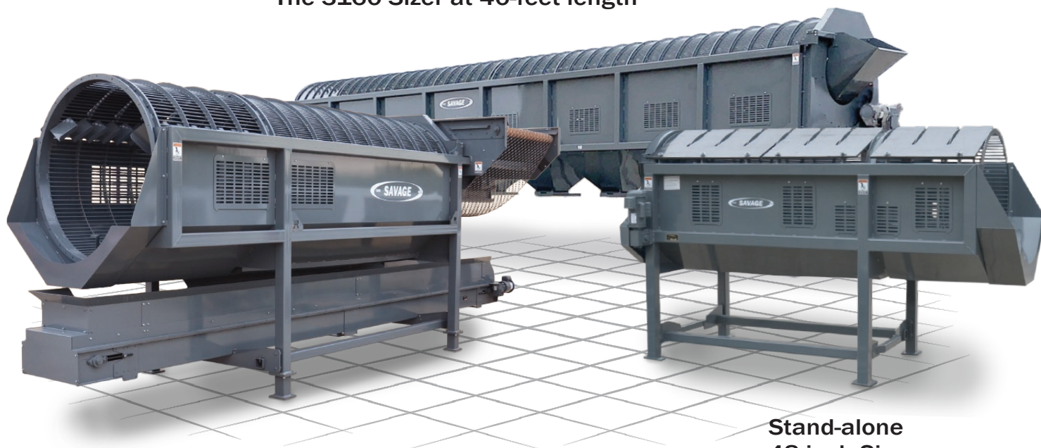
60" Stick Remover and Sizer (shown with trash conveyor)