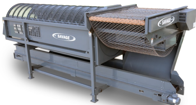
60" Sizer integrated with Stick Remover and Trash Conveyor

The Savage In-shell Sizer makes nut processing much more efficient.